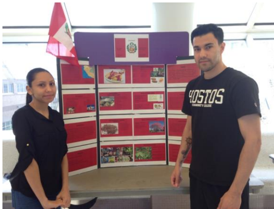
Students presenting their work, April 30

Twenty-two students interviewed informants from thirteen countries: Bangladesh, Belize, Colombia, Cuba, Ecuador, Ghana, Honduras, India, Italy, Nigeria, Peru, Poland, and Trinidad and Tobago, and students shared their results through poster presentations that they created. The research experience and oral presentation contributed to enhancing their academic formation in competencies such as reading, writing, oral communication, and global citizenship. This class activity takes place every semester including selected countries from the more than 120 countries represented in the Hostos community.