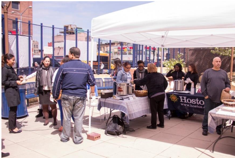
Hostos Garden Market, April 30