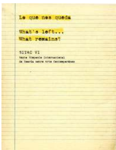
Lo que nos queda. What's left... What remains? SITAC VI.

Friday, October 2 6:30 pm Free admission