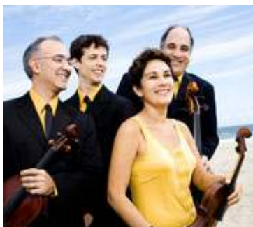
Quarteto Radamés Gnattali

Wednesday, October 7 7:00 pm Free admission