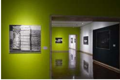
Installation view of Fernell Franco: Amarrados [Bound] at Americas Society 2009.

Americas Society is proud to present the first U.S. solo museum exhibition of Colombian photographer Fernell Franco (1942 - 2006). The exhibition is guest curated by Maria Iovino and features seventeen large-scale black and white prints. The exhibition takes its title from the artist's series of the same name, featuring work developed between 1978 and 1994 in the streets and markets of Colombia, Ecuador, and Peru. Depicting isolated, bound and wrapped structures, the photographs are exceptional in their use of tone, shadow, and composition. A self-taught practitioner who began his career as a photojournalist, Franco's work is now considered by leading critics to be among the most important in Latin American photography.