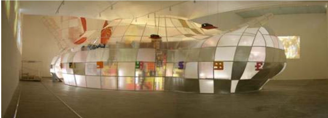
Cantos Cívicos 2008 installation view at MUAC.

Tuesday, October 20 6:30 pm Free admission