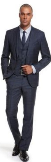
Business - Formal