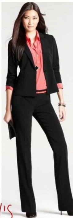
Business - Formal