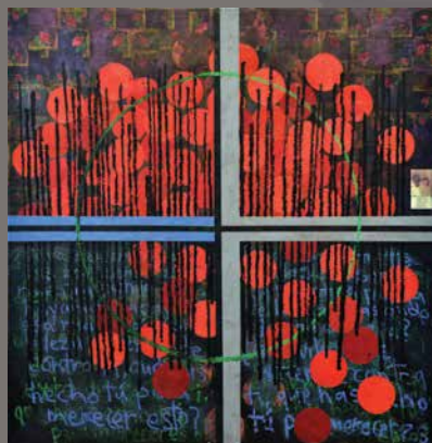
Juan Sánchez Filiberto: Blood Shooting , 2008 Oil and mixed media collage on wood panel, 74"x72"

Longwood Art Gallery @ Hostos | Sept 19 - Dec 7, 2016 - FREE ADMISSION | Gallery hours: 12:00 - 5:00pm Monday, Tuesday, Thursday & Friday